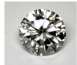
Photo may not be to scale and is for general design and appearance purposes.

This report is based on generally accepted grading techniques. Characteristics are determined using millimeter gauge, master comparison stones, UV Lamp, 10x loupe or binocular microscope.